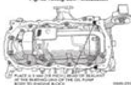
Fig. 24 Oil Pan Sealing