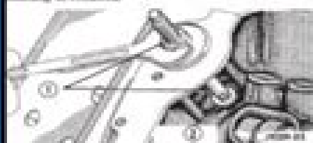
Fig. 42 Distributor Driveshaft Bushing Removal 1 - SPECIAL TOOL C-300 2 - BUSHING