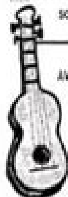
AVERAGE NUMBER OF SONGS REHEARSED