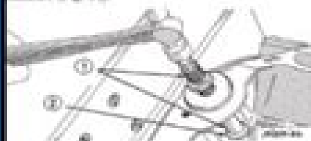
Fig. 44 Distributor Driveshaft Bushing Installation 1 - SPECIAL TOOL C-502 2 - BUSHING