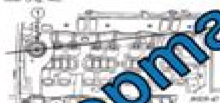
Fig. 46 Distributor Drive Shaft Rot