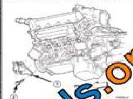
Fig. 47 Engine Insulator Mount Left Vehicle-Left Side 1 - ENGINE INSULATOR MOUNT LEFT SIDE 2 - MOUNTING BOLT