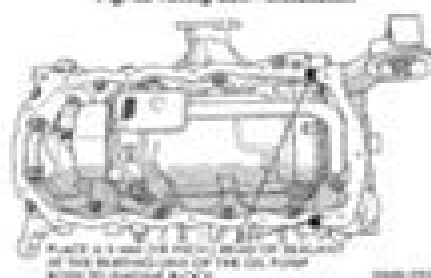
Fig. 24 Oil Pan Sealing