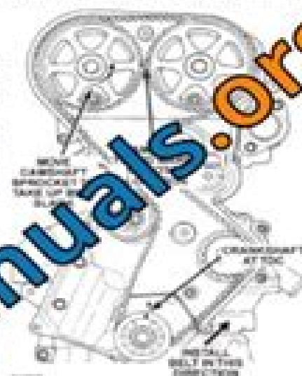
Fig. 23 Timing Belt—Installation