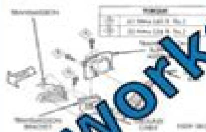
Fig. 21 Engine Mounting—Left