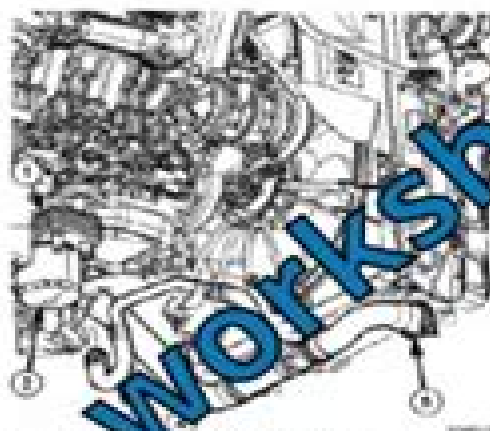
Fig. 36: Engine Oil Cooler, Coolant Hose, Filter & Lower Radiator Hose