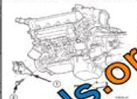
Fig. 34 Engine Insulator Mount Left Vehicle-Left Side 1 - INSULATOR 2 - MOUNTING BOLT