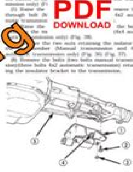
Fig. 36 Engine Rear Mount-4x4 Automatic Transmission 1 - ENGINE REAR MOUNT 2 - BOLT 3 - NUT 4 - THROUGH-BOLT NUT 5 - TRANSMISSION