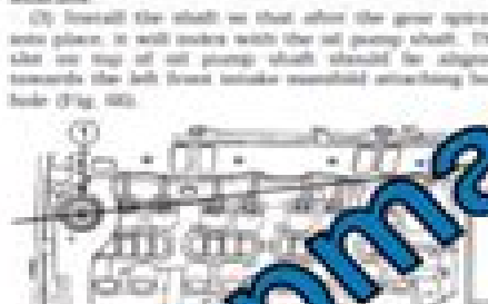
Fig. 46 Distributor Drive Shaft Rot