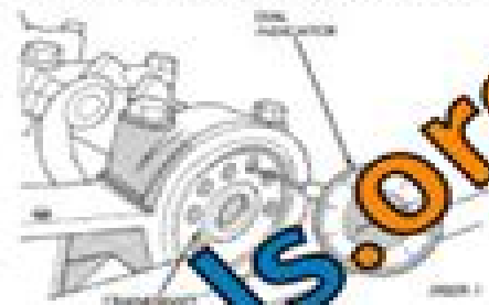
Fig. 18 Oil Pan Removal Measurement