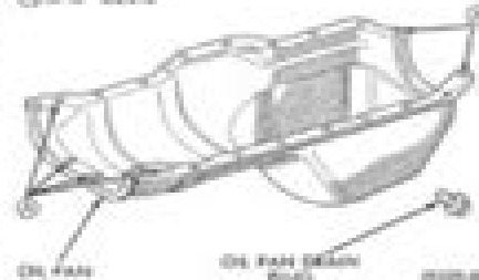
Fig. 18 Position of 5/16 Inch Oil Pan Bolts