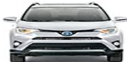
TOYOTA RAV4 HYBRID