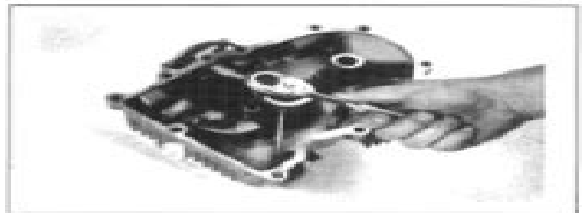
Figure 9-13. Removing Oil Pump and Oil Pickup.