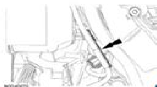
Fig. 10: Locating Electrical Connector Pin-Type Retainer

Detach the electrical connector pin-type retainer.