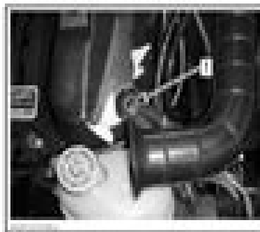
Air intake tube retaining screw