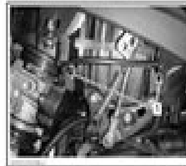
Locking tabs to remove