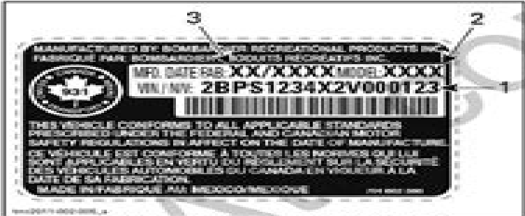
TYPICAL — VEHICLE IDENTIFICATION NUMBER LABEL

The VIN (Vehicle Identification Number) decal is located under the glove box on the passenger side.