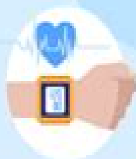
Remote patient monitoring