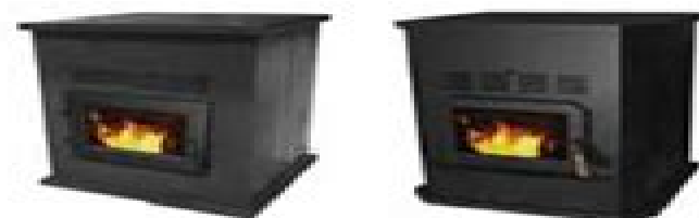
CORN BURNING SHOP & GARAGE HEATERS