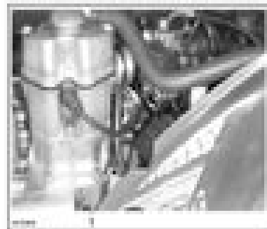
1 Engine intake line