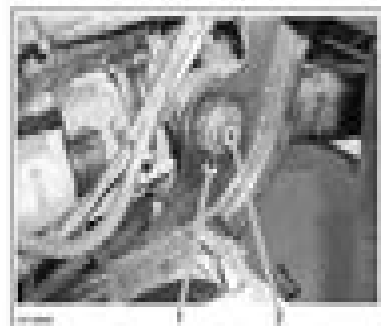
2. Pivot pin nut 3. Pivot bolt

On LH side, remove swing arm pivot pin nut and the pivot bolt.