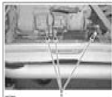
5. Engine intake valve

On RH side, remove the 2 bolts no. 8 retaining engine bracket no. 8 to frame.