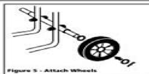
Figure 5 - Attach Wheels