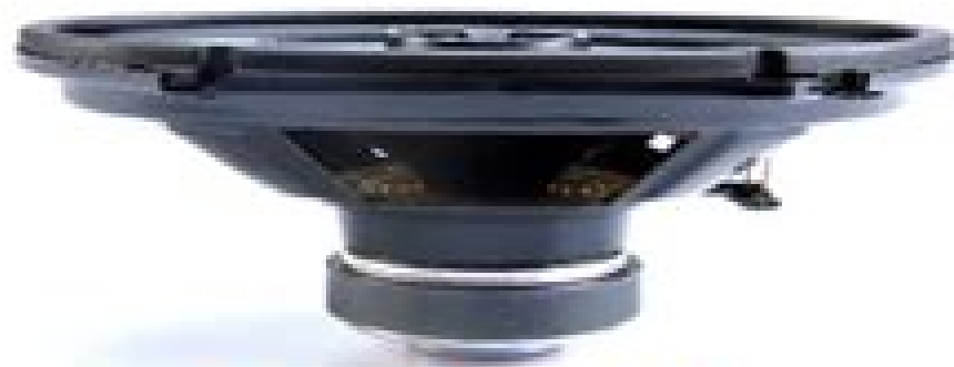
4x6 inch coaxials

Typical (approximate) installation hole size