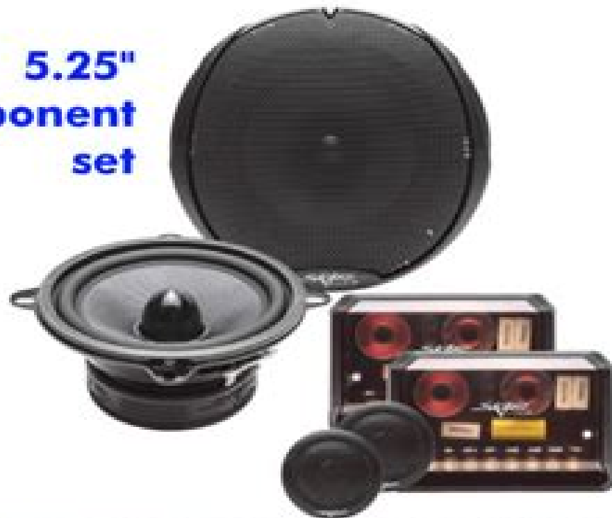
5.25" component set