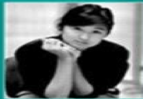
Maya Lin Architect and Artist