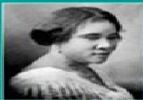
Sarah Breedlove Walker Businesswoman