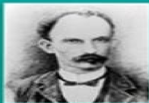
José Martí Poet and Writer