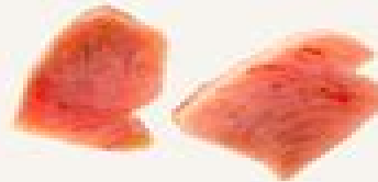
Albacore Tuna Steaks