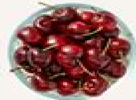
Dark Sweet Cherries