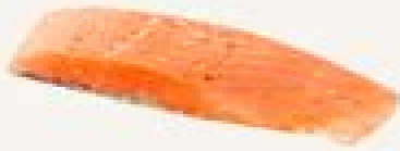
Atlantic Salmon Fillets