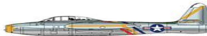
F-84 Thunderjet Introduced: 1947 Max Speed: 622 mph Length: 11.61m