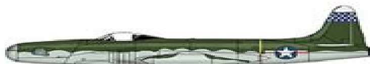
F-80 Shooting Star Introduced: 1945 Max Speed: 594 mph Length: 10.49m