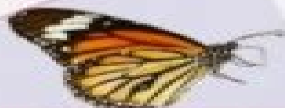
Image after enlargement