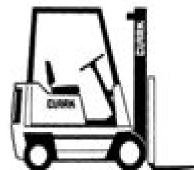
SM 548 ECS 17-30