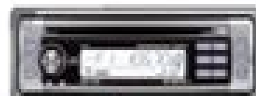
► MP33 MP3 MARINE CD RECEIVER