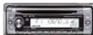
► MP33 MP3 MARINE CD RECEIVER - REMOTE CONTROL