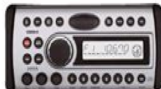
► CR04 MP3 MARINE CD RECEIVER - REMOTE CONTROL

► CR04 MP3 EXTREME MARINE CD RECEIVER REMOTE CONTROL