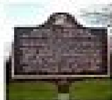
A monument stands in the city of Little Rock, Arkansas, to honor the students who were the first to integrate the city's schools.

In the 1950s, many people in the South believed that white people should be treated differently from Black people. This was called segregation . In the 1950s, many people in the South believed that white people should be treated differently from Black people. This was called segregation .