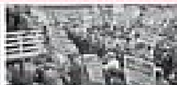
A group of students who were the first to integrate the city's schools.