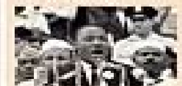
Martin Luther King Jr. speaking at a podium.

King's speech was very powerful. It inspired many people to join the Civil Rights Movement. King's speech was very powerful. It inspired many people to join the Civil Rights Movement. King's speech was very powerful. It inspired many people to join the Civil Rights Movement.