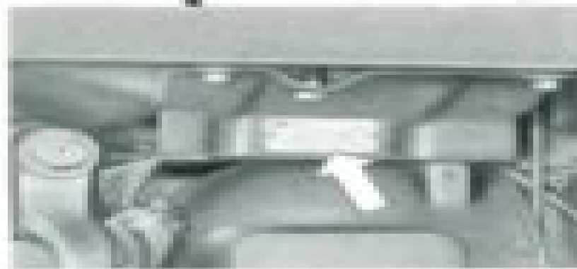
Fig. 3. - Identification Data Plate.