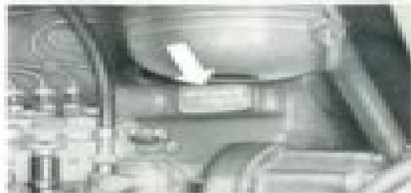
Fig. 1. - Engine Serial Number.