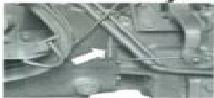
Fig. 2. - Frame Number.