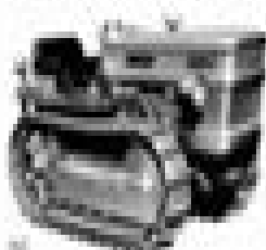
Model 200 E