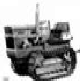
Model 200 E