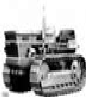
Model 200 E