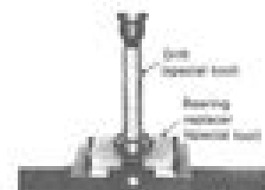
Separating the sprocket from the bearing

Special tool Bearing rollers ST1123 0000 Sprocket rollers ST1124 0001