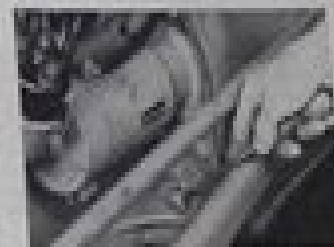
Turning the valve adjuster to set the valve clearance.

on of #1 cylinder. After compression is felt, turn slowly with crank until piston is at top dead center. (Piston is at top dead center when the piston is at the top of the cylinder and the piston is at the top of the cylinder).