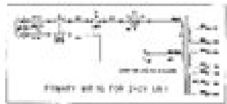
POWER SUPPLY FOR 200V UNIT