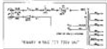
POWER SUPPLY FOR 115V UNIT