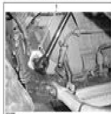
1 - Pivot pin

On RH side, remove the other pivot bolt.