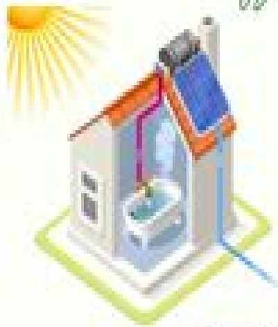
Solar Heat Energy