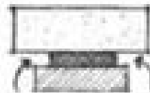
Gate segregates public-private