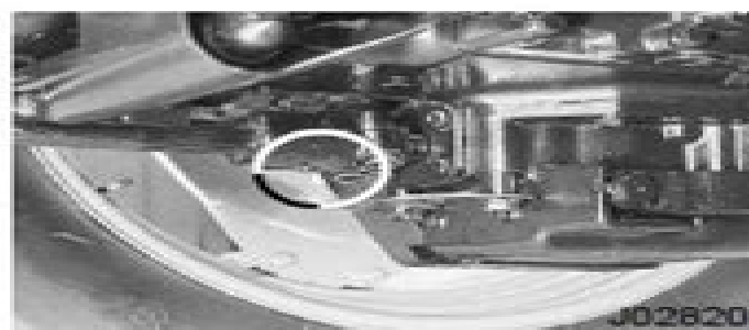
MFD Drive Coupling .....1