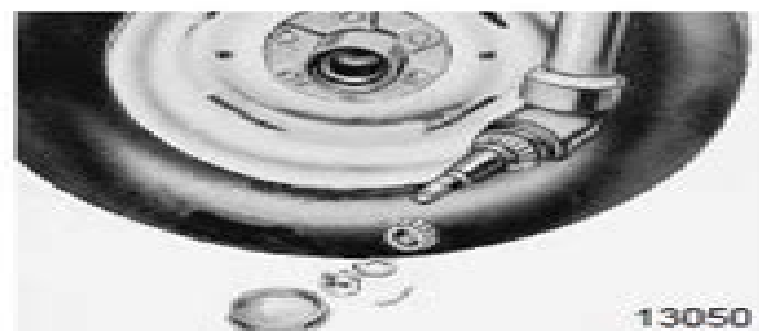
Front Wheel Bearings (2WD) .....2