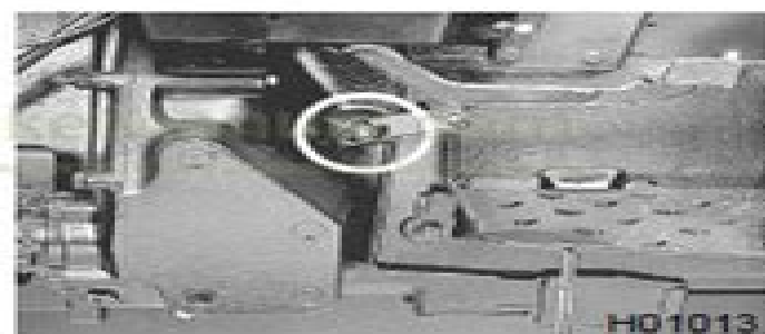
Clutch Pedal Shaft (both sides) (Non-Cab).....2