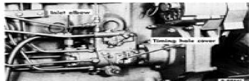
Illustr. 17A Rocco injection pump.