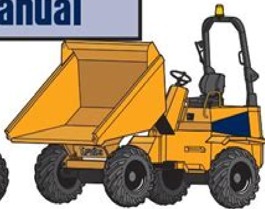
Mach 565 – 6 Tonne Front Tip