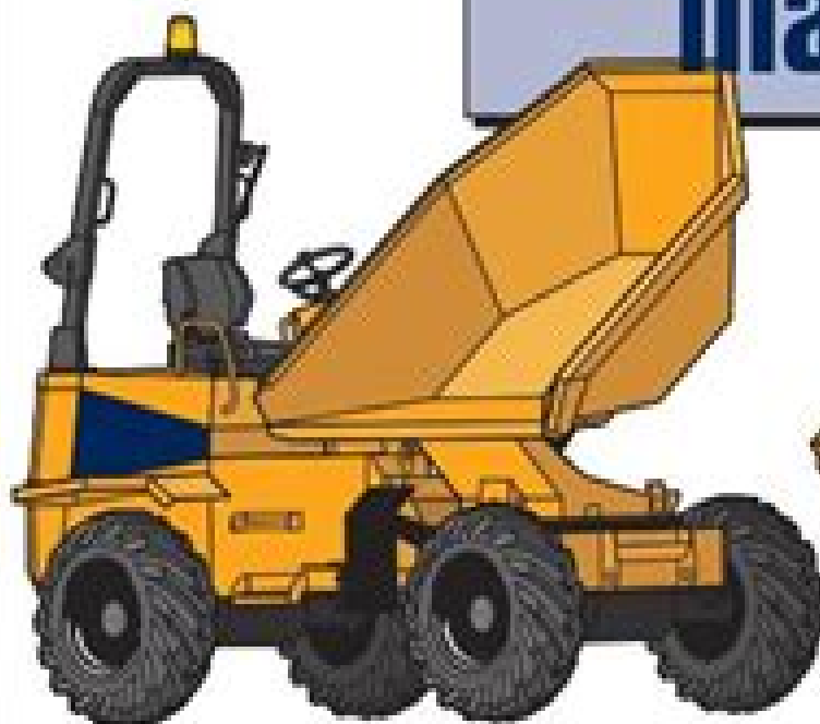
Mach 564 – 6 Tonne Powerswivel