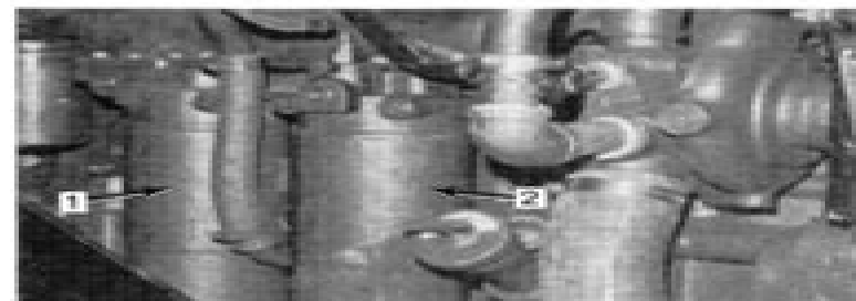
Figure 62: L10 Cummins

1- By-Pass Oil Filter 2- Full Flow Filter