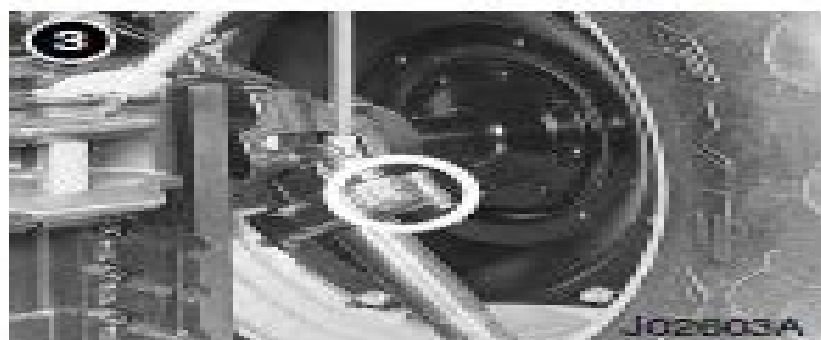
Levelling control gearbox (if equipped)