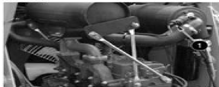
1. AIR RESTRICTION INDICATOR SWITCH

Push the hood to the right hand side of the machine and remove the left hand side of the hood from the pivot pin. Remove the hood from the machine.