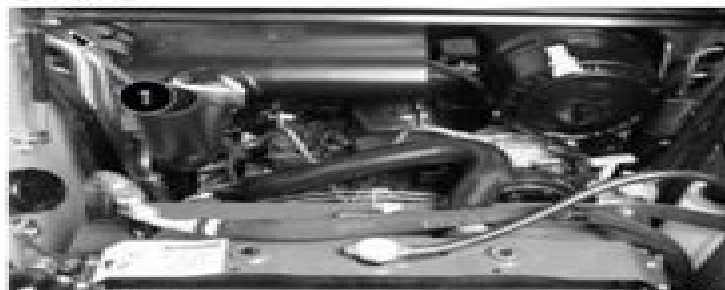
1. CYLINDER PIVOT BOLT

Remove the nut from cylinder pivot bolt (1) on the hood end of the cylinder.