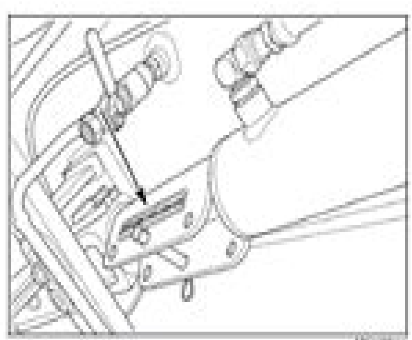
LOCKING BLOCK INSTALLED ON ROD END OF ARTICULATION STEERING CYLINDER

installed in the storage position before attempting to steer the tractor.