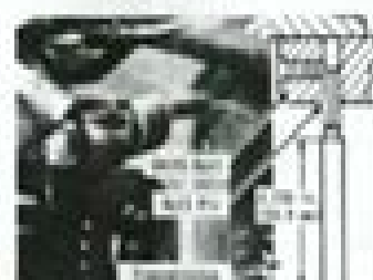
Fig. 39 - View showing pin removal and transfer. Refer to text.