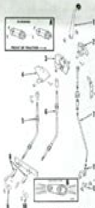
Fig. 37 - Exploded view of four speed with range and park lock shims on Model 2000 and 2000 (factory as equipped)