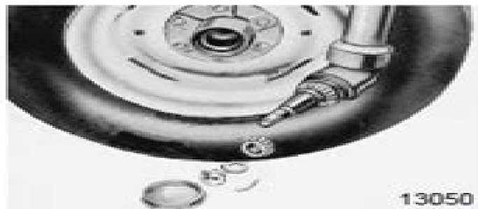
Front Wheel Bearings (2WD) .....2