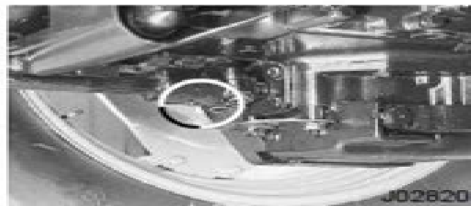
MFD Drive Coupling .....1