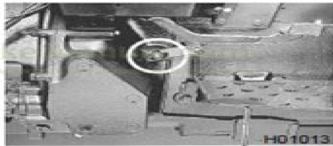
Clutch Pedal Shaft (both sides) (Non-Cab).....2