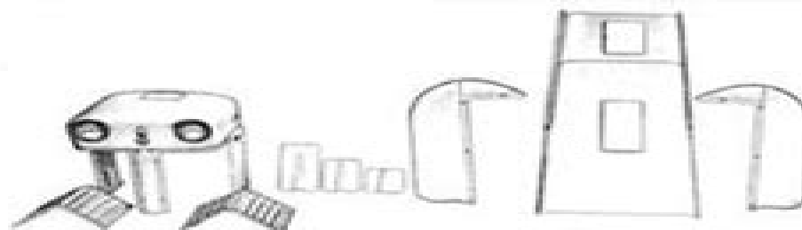
Fig. A-2 Sheet Metal Removed "500B" and "600B"