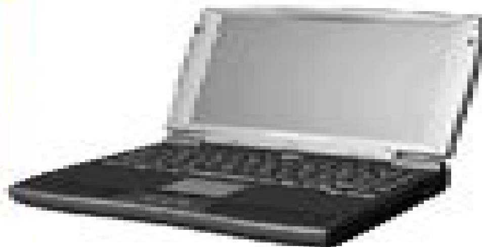
Product 02,0400 Series

This section applies to the 02,0400 Series. The 02,0400 Series is a small, black, rectangular unit with a screen and a keypad.