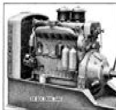
Fig. 2 - Air Box Drain Tank Installation

The very early engines had an air box drain tube which was installed in either the cylinder block or a tank hole cover on the side opposite the filter. This was done since no vent or air box drain passages were provided in the side of the block. The drain tube