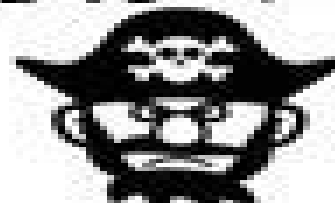
Long John Silver

I know \triangle ABD \cong \triangle ACD by _____