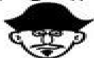
Captain Jack Sparrow

These pictures are used, but they have constructed triangles. How many of these constructions are wrong? Write the reason (ASA, SAS, AAS, SSS or the Protractor) on the line.