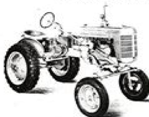
Illustr. A. International A equipped with electric starter and lights.

The economical operation and ease of handling makes the International A an ideal tractor for light hauling jobs, highway mowing, sideways snow plowing, sweeping, and many other jobs within its power range.