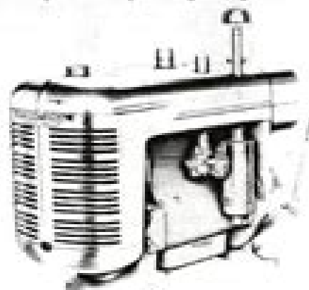
Illustr. B. International Model U-2 equipped as a complete, closed-type, independent portable power unit.