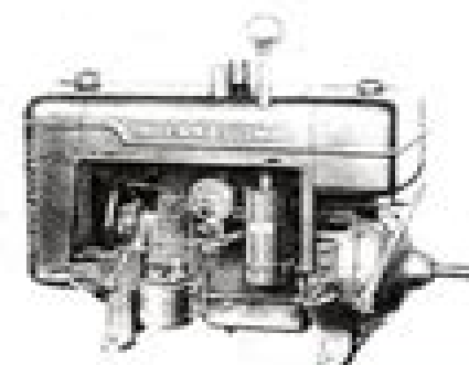
Illustr. B. Left side of U-2 power unit with carburetor, gas and gasoline carburetor, U.S.A.