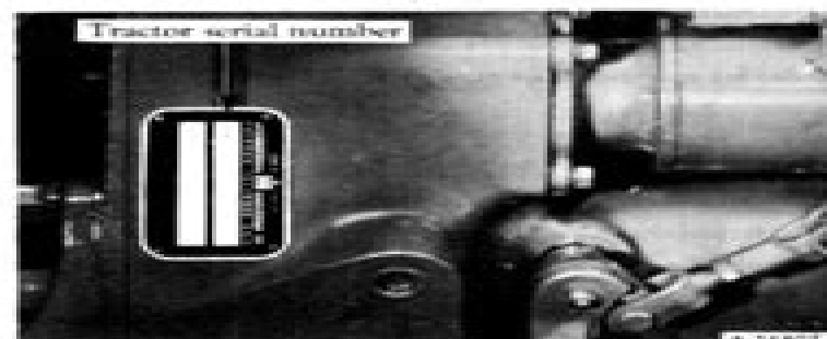
Illustr. 2A Location of the tractor serial number.

When in need of parts, always specify the tractor and engine serial numbers. The tractor serial number is stamped on a name plate attached to the left side of the clutch housing. See Illustr. 2A .